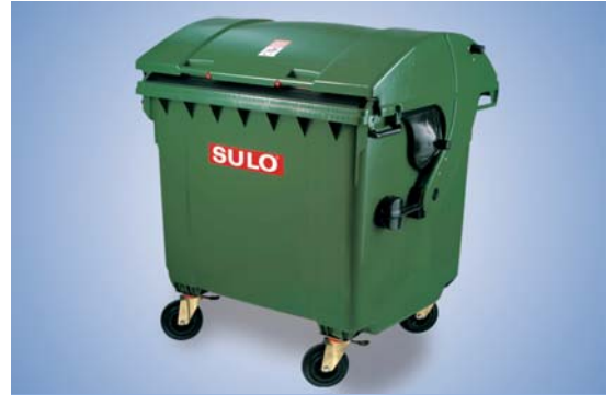
MGB 1100 dome lidded with child safety device