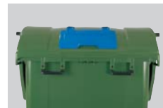
lid within a lid