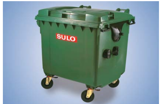
MGB 1100 flat lidded