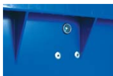
triangular lid lock