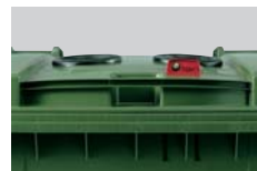
automatic lock 2303