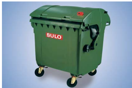
MGB 1100 dome lidded automatic lock