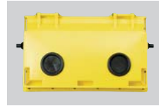
150 mm Ø