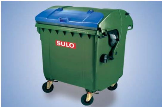
MGB 1100 dome lidded lid within a lid