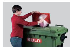
lid within a lid