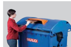
paper hood on top