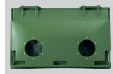
200 mm with rubber rosette