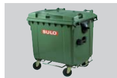
lid opening device