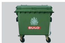
mould on graphics