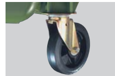
elastic-solid rubber tyres