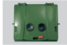
150 mm Ø