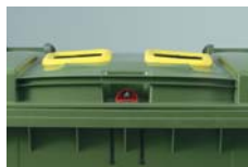
automatic lock 2300/2303