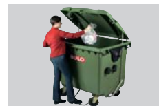
lid opening device