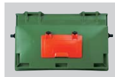
lid within a lid