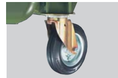
steel rim, ball bearing