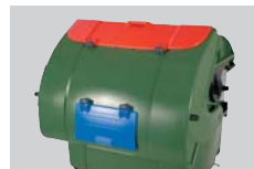
lid within a lid