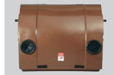
150 mm Ø