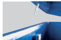
triangular lid lock