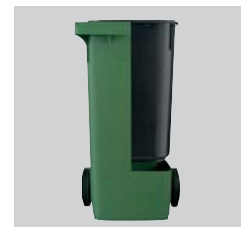
80 litres square insert