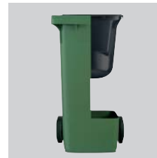
40 litres round insert