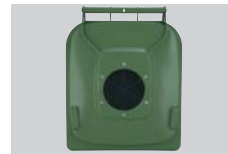
aperture for recycling 200 mm