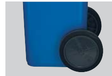
wheels 250 mm