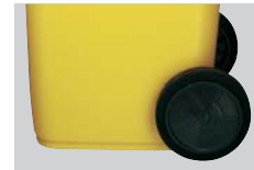
wheels 250 mm