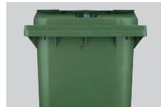
triangular lid lock