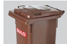
triangular lid lock