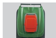
lid within a lid