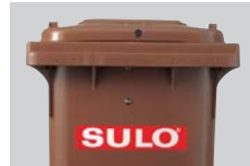
triangular lid lock