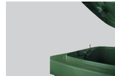
triangular lid lock