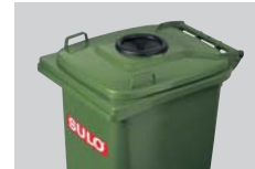
aperture for recycling 150 mm