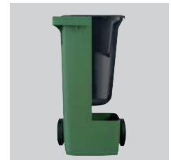
50 litres round insert