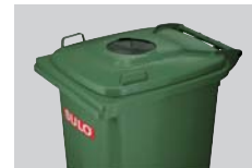
aperture for recycling 200 mm