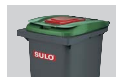
lid within a lid