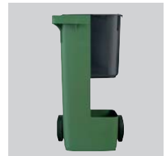
60 litres square insert