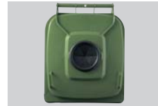
aperture for recycling 150 mm