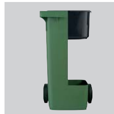
35 litres square insert